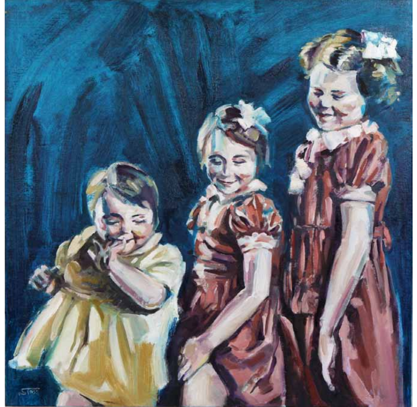
Three Brides , 2010. Oil on Canvas, 36 x 36 inches