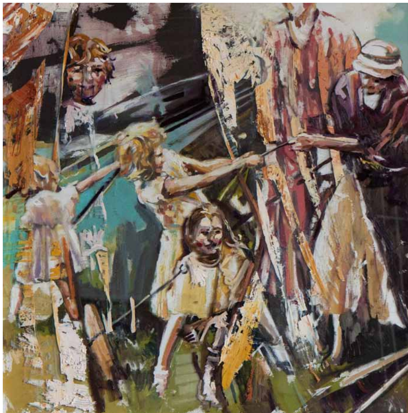
The Hegemony of Weakness , 2011. Oil on Canvas and Glass, 36 x 36 inches