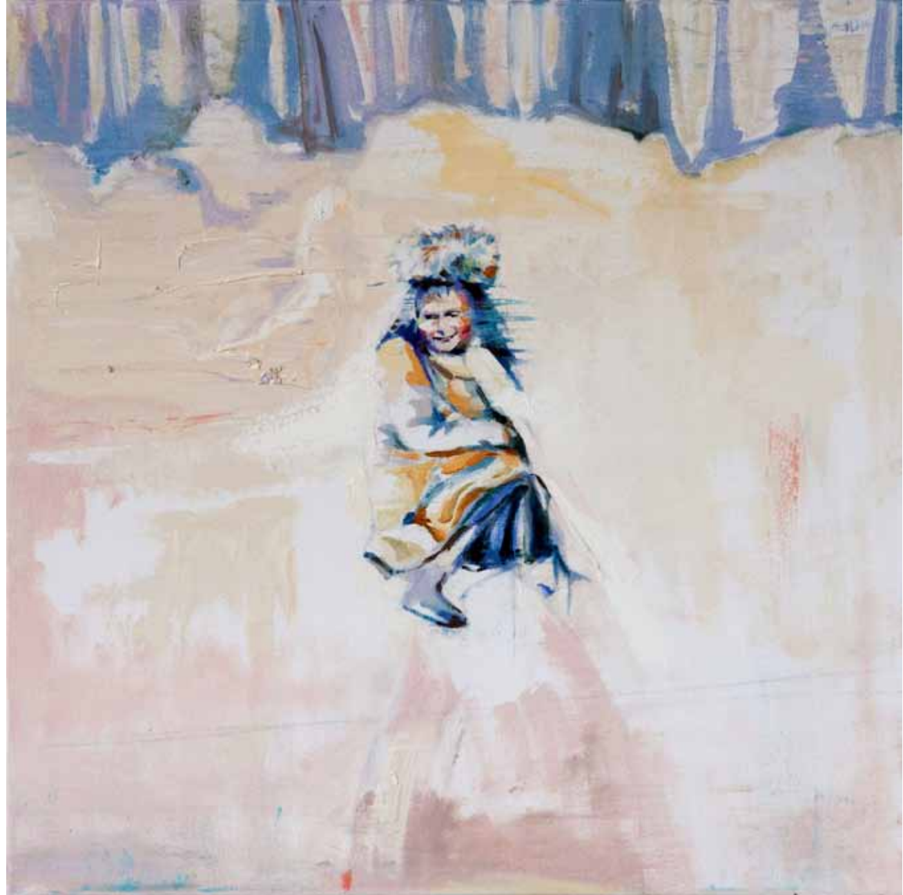
A Splinter of the Empire , 2011. Oil on Canvas, 24 x 24 inches