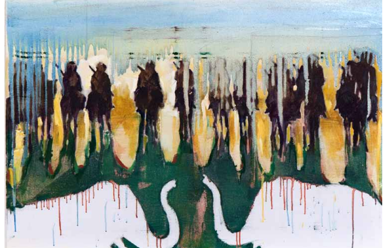
Eastern Front , 2011. Oil on Canvas, 24 x 36 inches