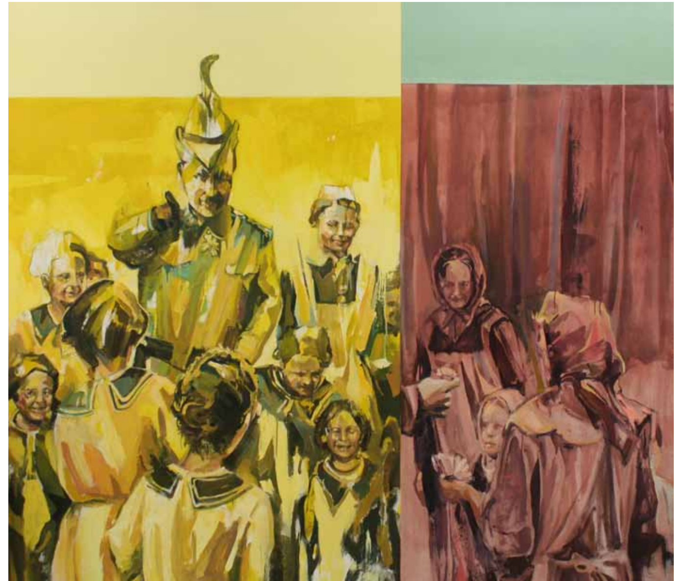
Collectively Charged , 2012. Oil on Canvas, 84 x 96 inches