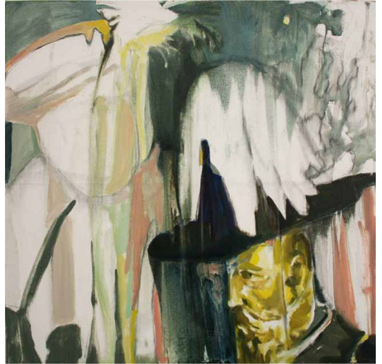
Queen Incognito , 2012. Oil on Canvas, 24 x 24 inches