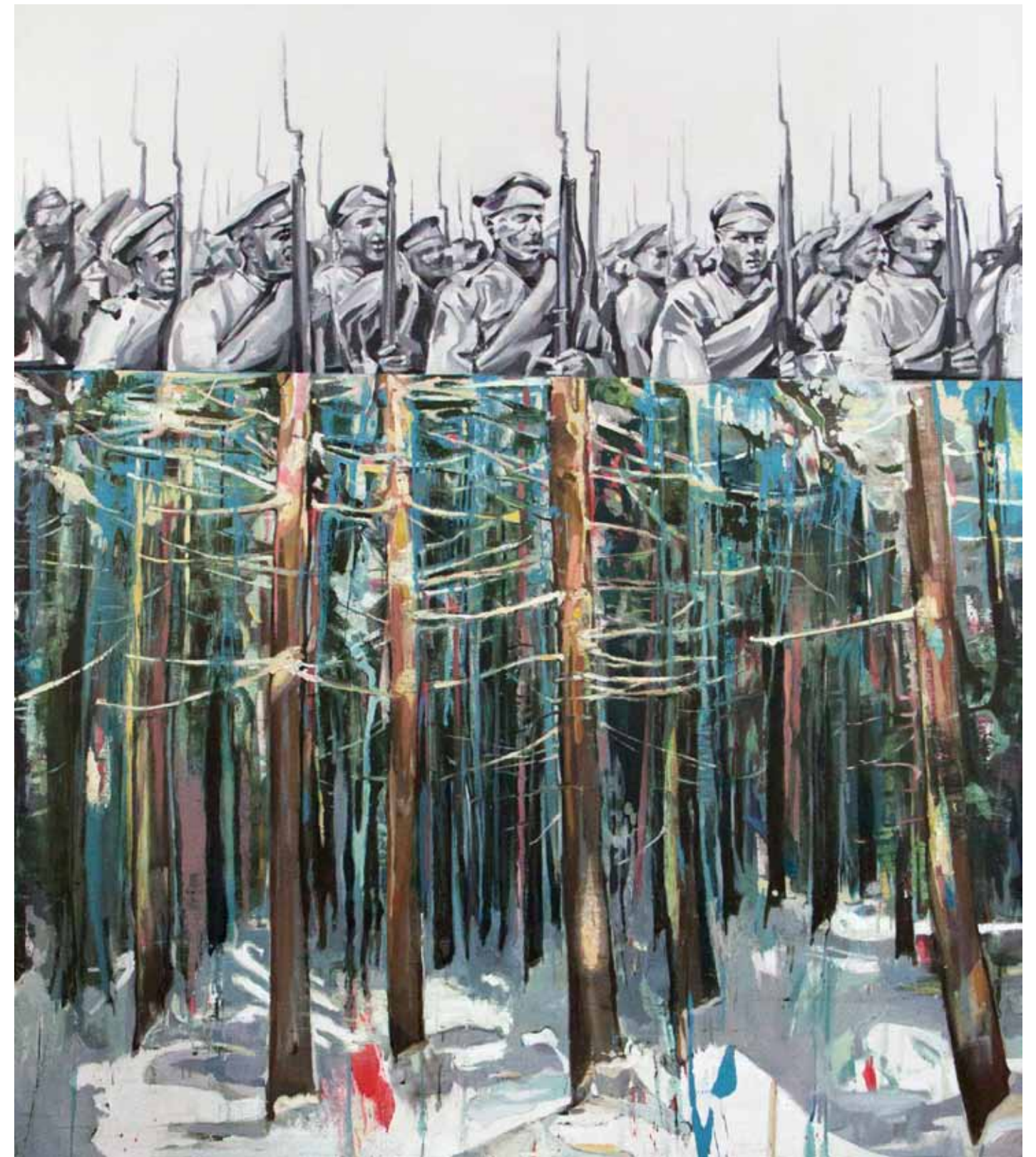
The Dichotomy of War , 2011. Oil on Canvas, 96 x 84 inches