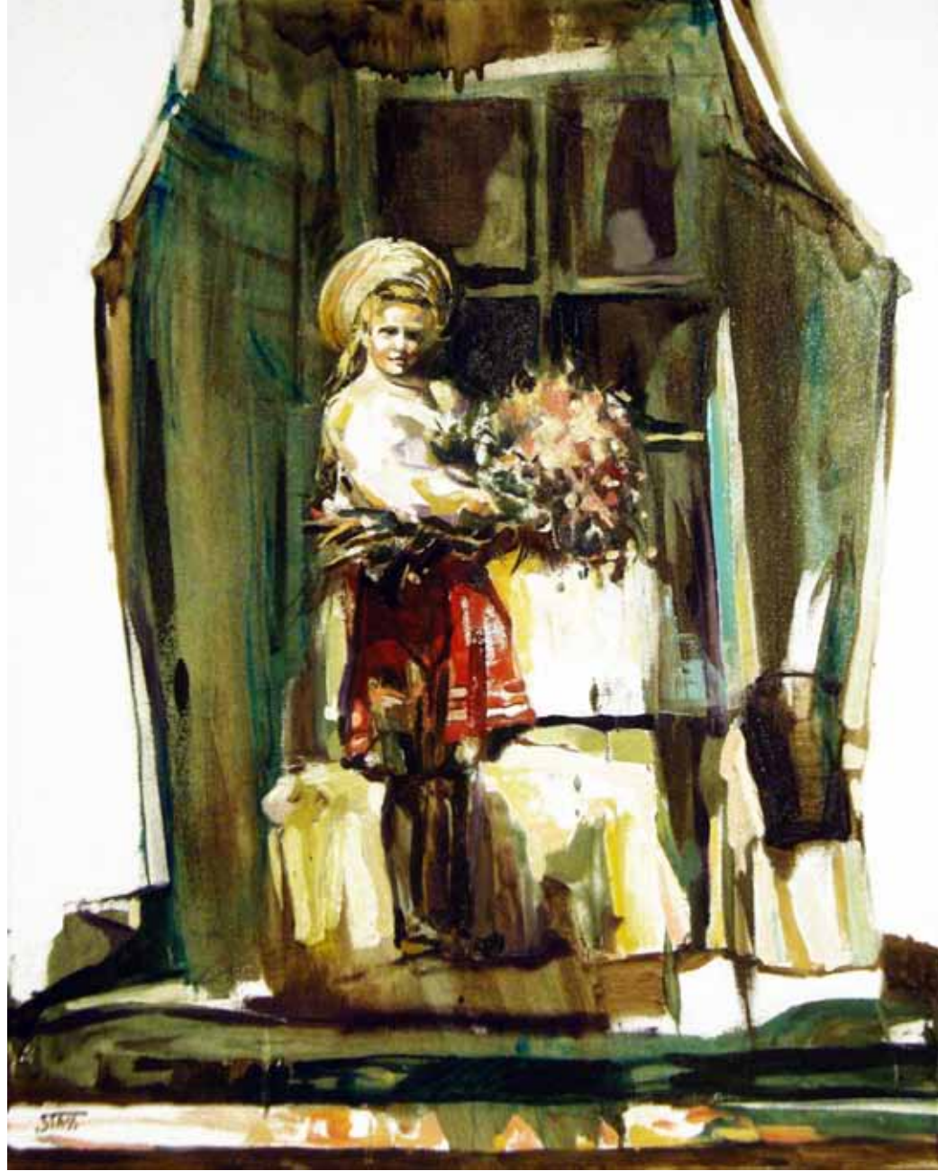
The Blank Curtain , 2011. Oil on Canvas, 30 x 24 inches