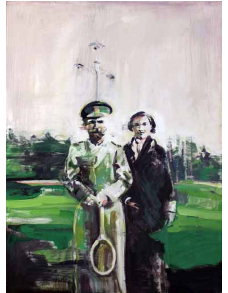
Nicolas II Playing Tennis , 2010. Triptych. Oil on Canvas, Each: 48 x 36 inches