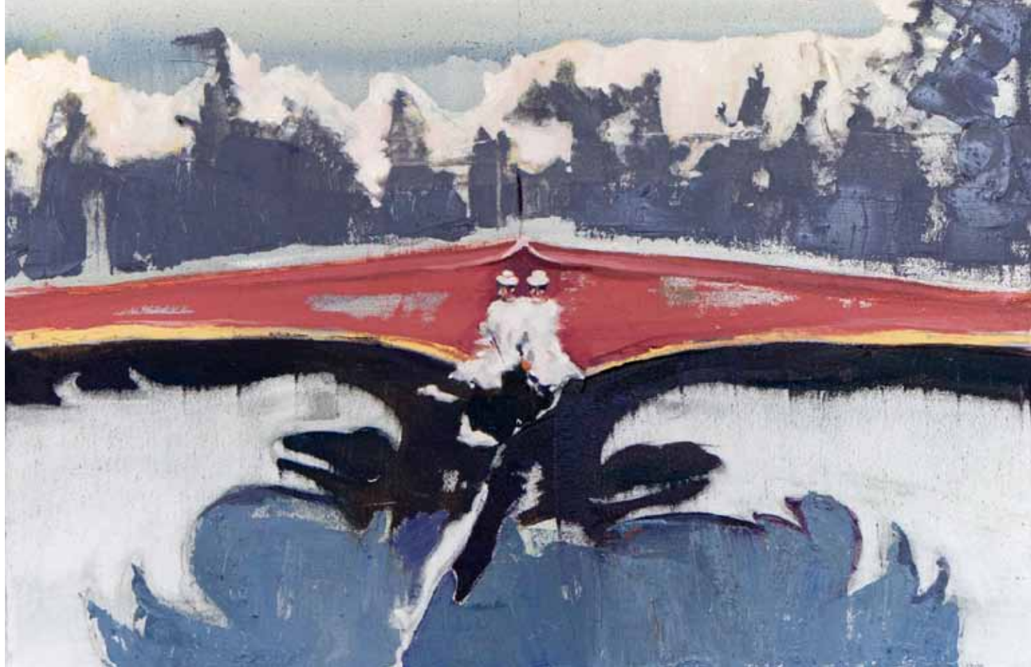
Monumentality , 2011. Oil on Canvas, 24 x 36 inches