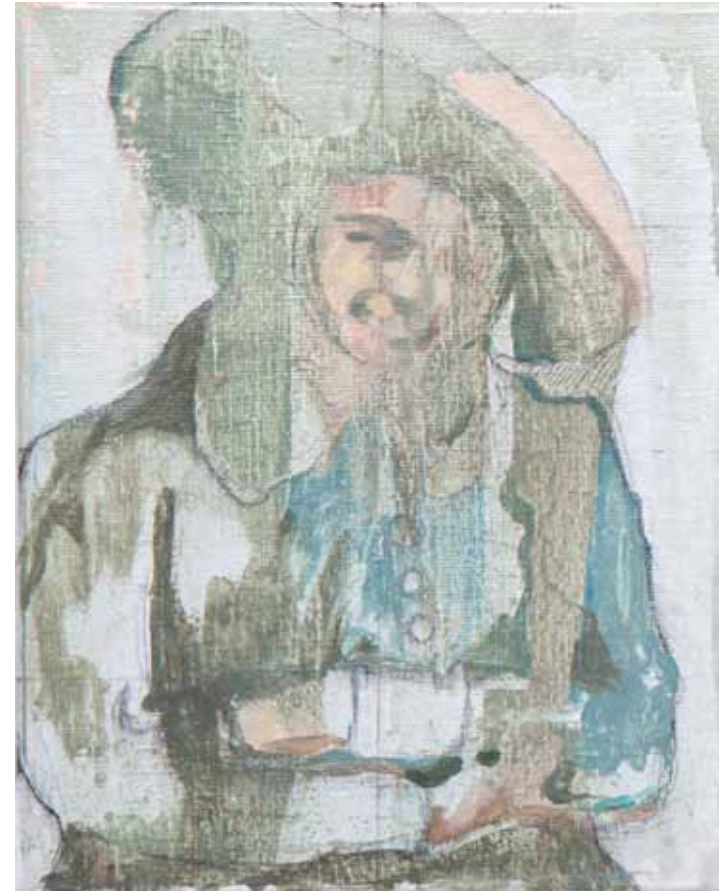
Internal Conversation , 2011. Diptych. Oil on Linen, Each: 10 x 12 inches