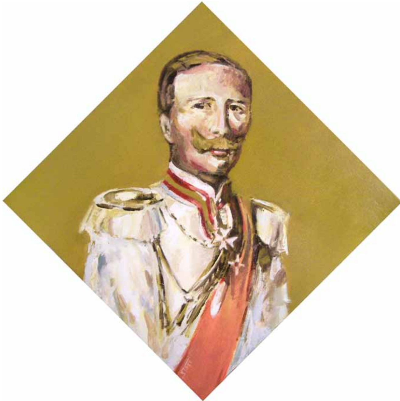
The Golden Moustache , 2010. Oil on Canvas, 20 x 20 inches